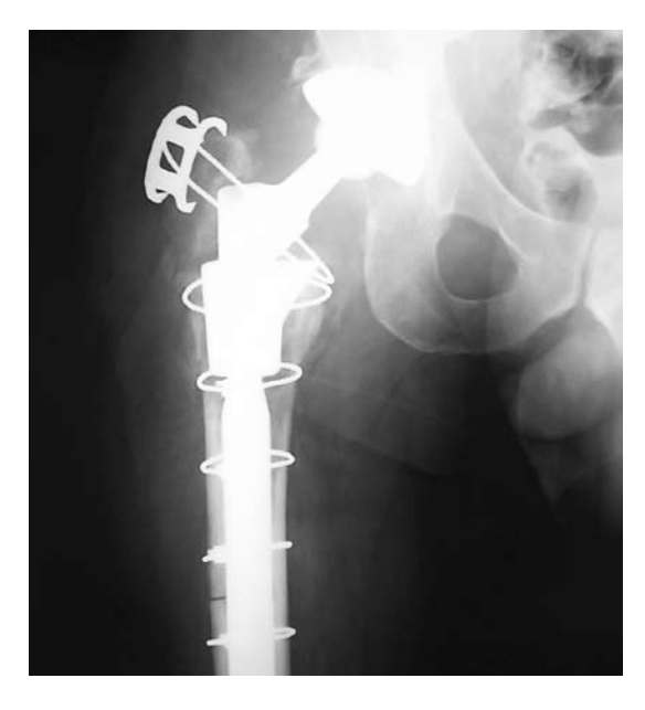
Revision Hip Replacement Surgery